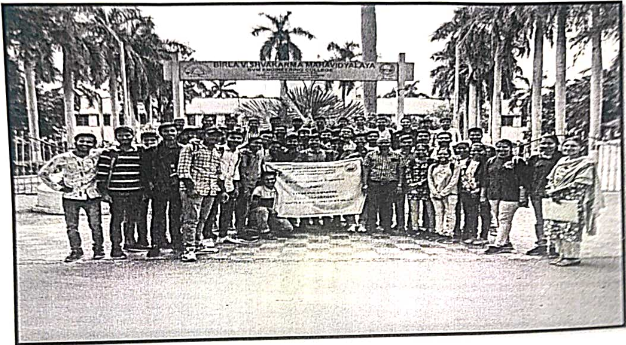
Fig.(1) Students and Faculties at BVM Front gate